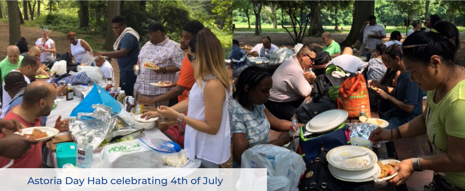
Astoria Day Hab celebrating 4th of July