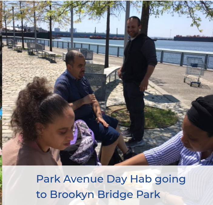
Park Avenue Day Hab going to Brooklyn Bridge Park