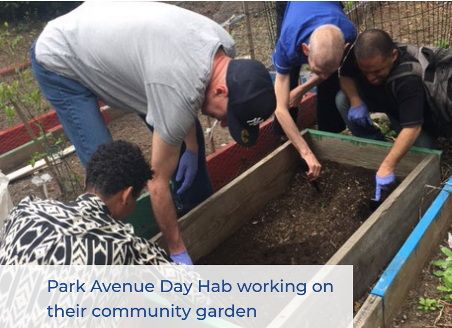
Park Avenue Day Hab working on their community garden